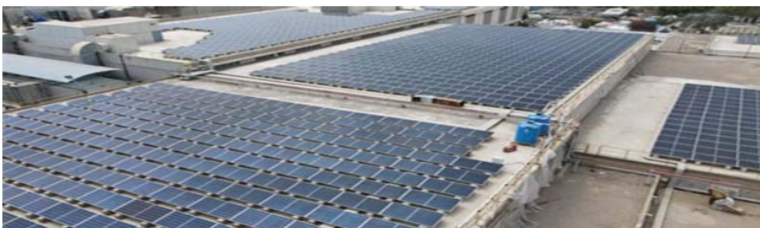
Solar plant installation at Gatron (Industries) Limited