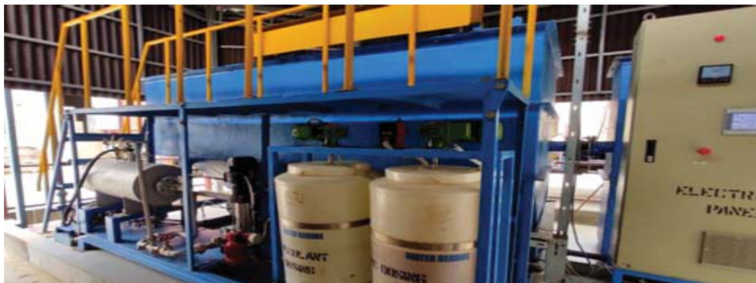
Dissolved Air Flotation System

Despite the setbacks brought on by FY 2020-2021, we are wholly dedicated to further the water conservation and intend to commit more resources to Clean Water and Sanitation. Reducing our water consumption and ensuring our effluent does not adversely effect our ecosystem will indirectly also lead to reduced CO 2 emissions due to reduced Water Tanker movement to our factory.