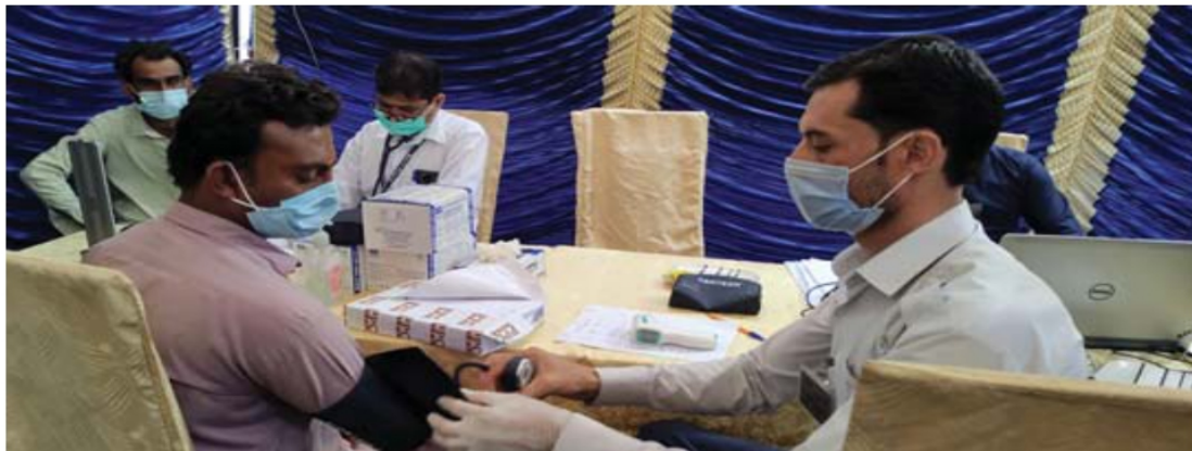
Vaccination drive at Gatron (Industries) Limited

All expenses of our Eye Care Clinics provided through the Welfare Chapter of Gatron Foundation.